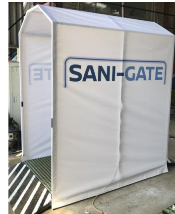
Structure, Cover and flooring