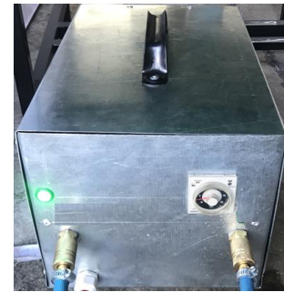
Smart Pump Control Box